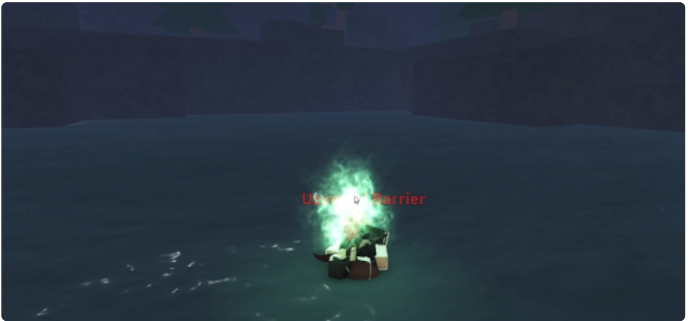
Sloop Uchiha gripping Crow Uzumaki at the end of their duel

Crow Uzumaki's legacy endures as a key figure in Stone Village's history. His dedication, strategic prowess, and sacrifices left an indelible mark on Iwagakure, contributing to its status as one of the strongest ninja villages. Crow Uzumaki and Sloop Uchiha battled in the waters of Iwagakure but he was defeated and laid to rest.