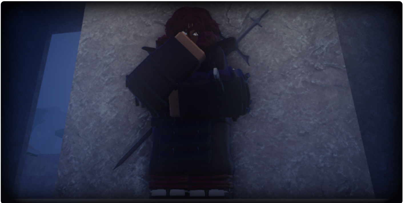
Rui dawning spoils of war

Years later, peace had been restored to Mainland or so the Shinobi world thought. Konoha and Sunagakure would create an "Alliance" after the death of Musashi Kurogane and the destruction of the new Iwagakure. Though this was a strong alliance, it wouldn't last long the inevitable repeated itself and the cycle continued. The Second Konoha-Suna war started as conflicted had risen due to Konoha's new improved relations with Iwagakure. Rui Hyuga would wait for his opportunity to strike if his men were struck upon first as he had always gone by. Eventually, Sunagakure had made a move, killing a close friend of Rui's named Renji Kurogane. With this, Konoha fully prepared its launch on Sunagakure ending it once and for all. Battle had begun between Konoha and its group of allies and Sunagakure. Hours upon bloodshed and tear drops, Tall Yome, one of the strongest mainland beings to exist had eventually fallen as Konohagakure claimed his head. With Konoha's actions they avenged the Second Hokage, Carter Uchiha's death and went on to prosper, with this Rui Hyuga would go on to Claim Tall Yome's blade as souvenir and proof of defeating the First Kazekage. Rui Hyuga continues to reign and draws up plans for Konoha's future as one of their biggest threats was out of the picture.