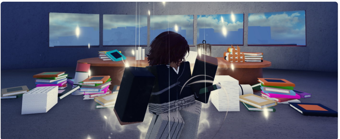
Rui Hyuga, The Third Hokage

Kento Uchiha would retrieve the body of Rui, wearing the armor as homage. He left behind his sister, Dakota Hyuga, his son, Axtra Hyuga, and his cousin, Dan Hyuga. He would also have taught many coming to be prominent shinobi, including Y'mir Yuki. Although many viewed him as a tyrant, he kept his belief true and fought in repentance, to save the family he struggled to protect. Regardless of if he was a Tyrant, he was an honorable one at that.