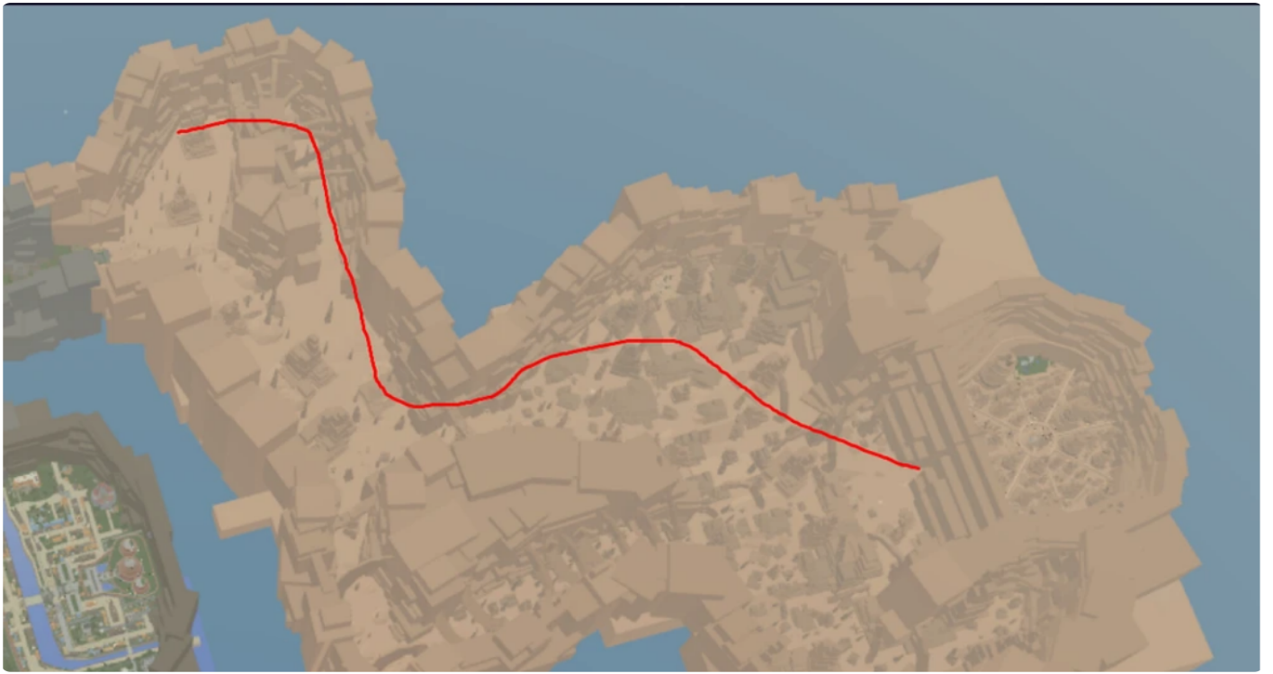
The Best Route for Kazesuna EXP