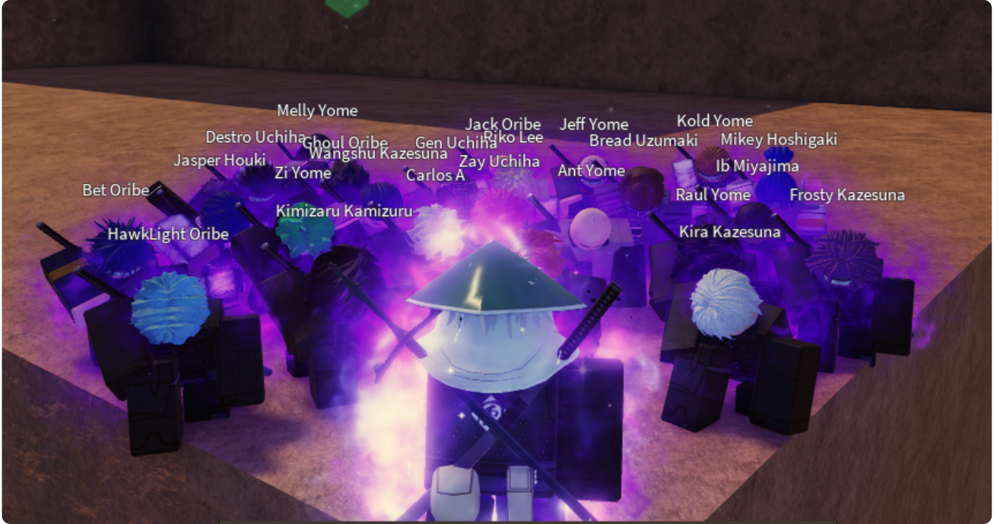
First Kazekage Tall Yome of Sunagakure with his Loyal Shinobi