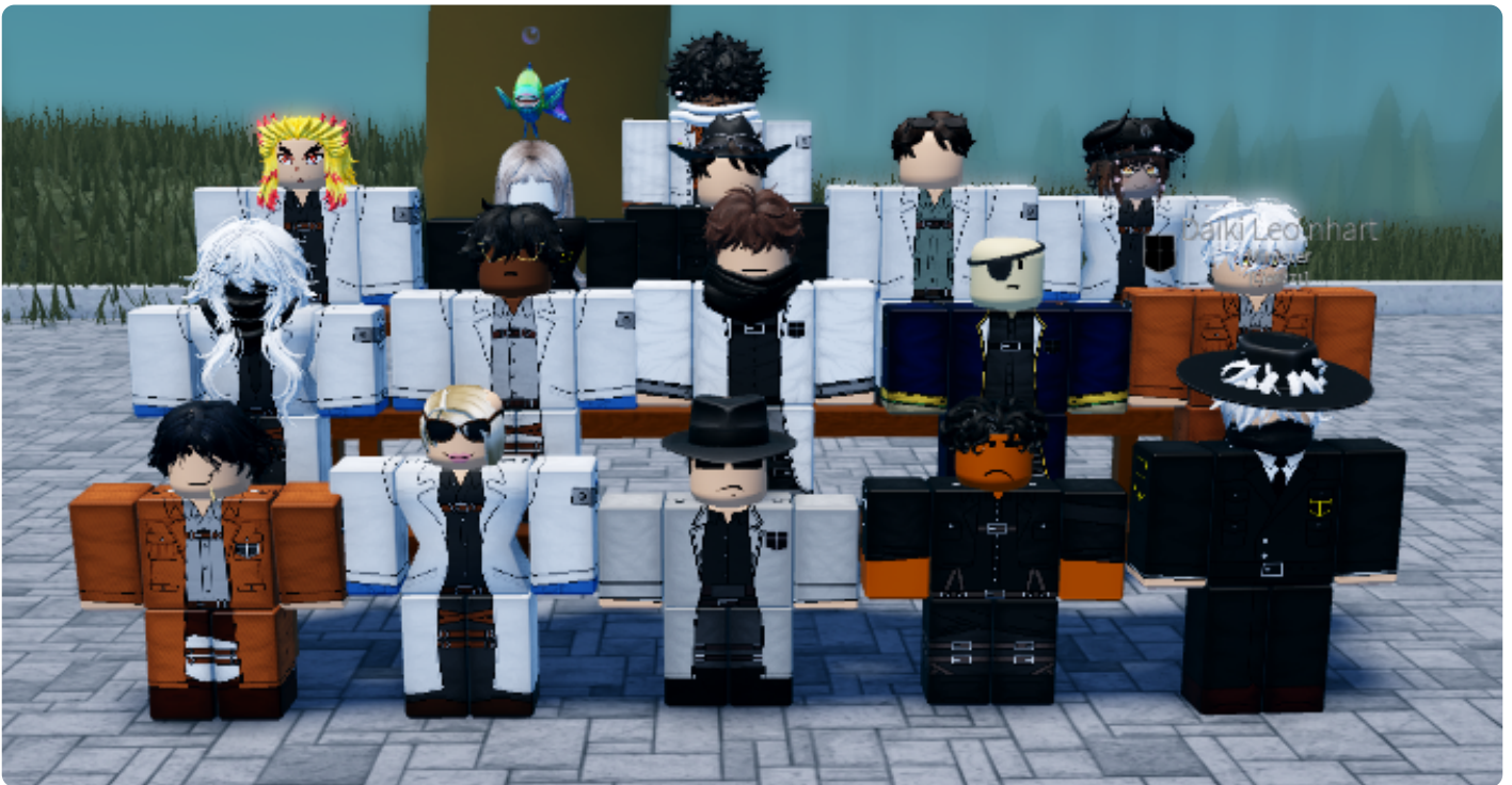
Government officials and representatives of districts at Humanity's court room within the interior of Wall Sina

The Government Engineers are the technological wing of the Royal Government. They spearhead the technological progression of Eldia both militarily and civil alike. This group oversees the research, manufacturing, distribution, and regulation of all newly engineered technological progression within the walls. This is to ensure the proper usage and the consistent improvements in the quality of said technology to better prepare Eldia's society from both external and internal integral issues. Although answering to the Prime Minister, this group is unaffiliated with political affiliations or factions; it's members work in a bias free environment for the sake of Eldia's future. The current Chief Engineer is Gabboli Smith . The current Assistant Engineers are Alwin Marseille and Tanya von Degurechaff .