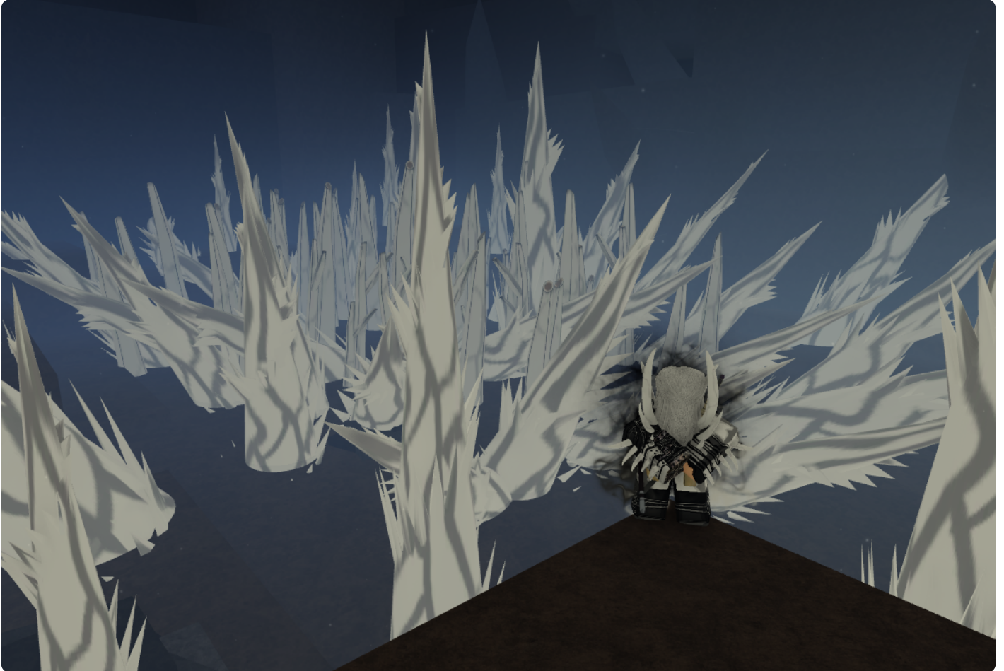
Kenzo Kaguya, one of the few remaining members of the Kaguya Clan

it should be noted alot of information has been left out due to request of players attending the arc to not fully elaborate on things.